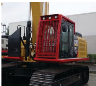
CAB GUARD WITH FRONT SCREEN