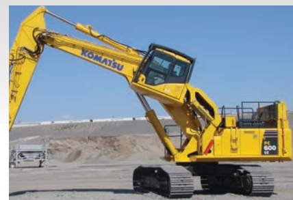
ELEVATE AND TILT