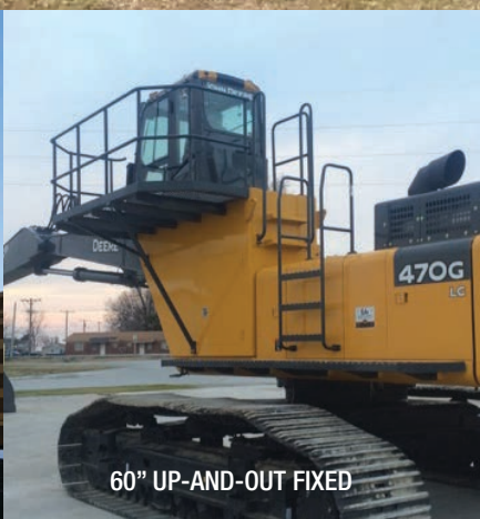
60" UP-AND-OUT FIXED