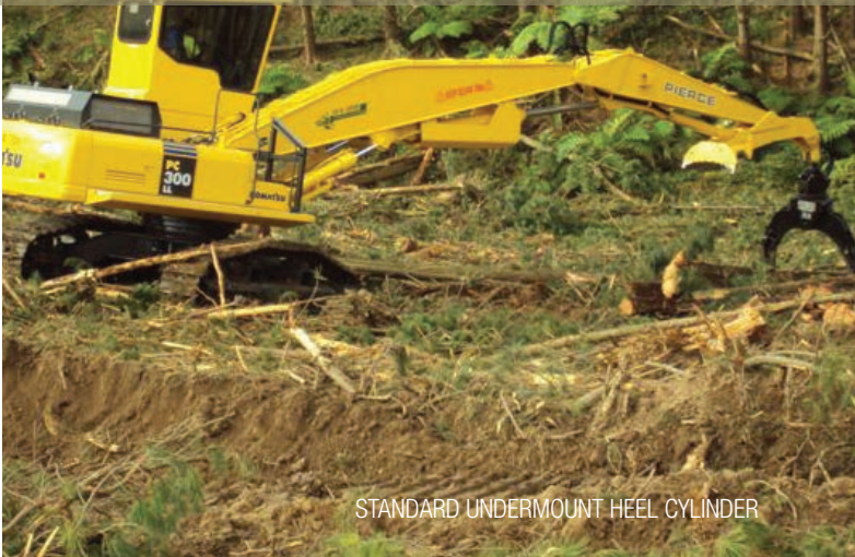
STANDARD UNDERMOUNT HEEL CYLINDER