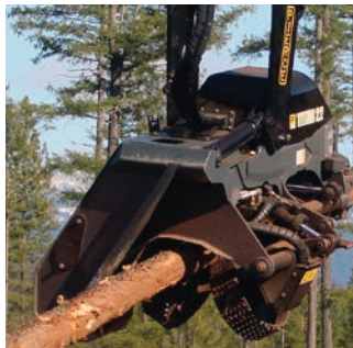
TITAN 22/TITAN 23