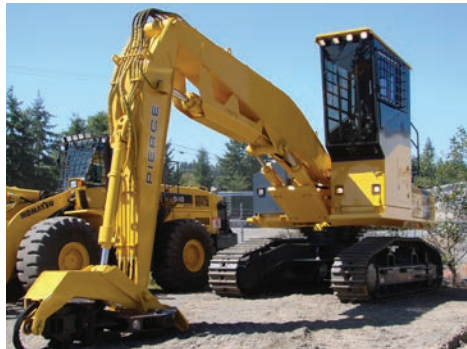
TOP-MOUNT LIVE HEEL