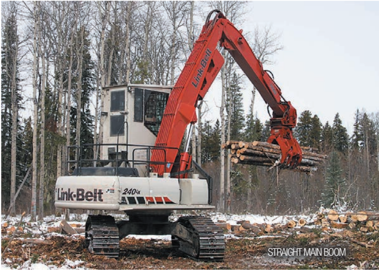
STRAIGHT MAIN BOOM