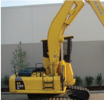
CAMBERED MAIN BOOM