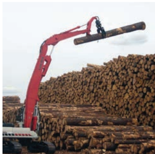
TOP MOUNT HEEL CYLINDER