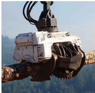
GRAPPLE PROCESSOR (GP)