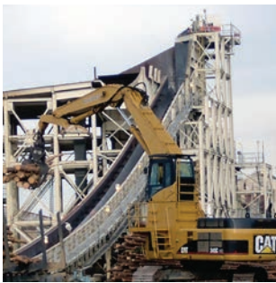
UNDERMOUNT HEEL CYLINDER