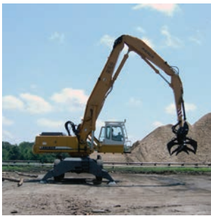
3-PIECE BUTT N TOP