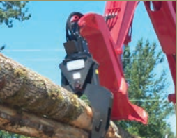
LIVE HEEL GRAPPLES