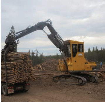
CAMBERED MAIN BOOM