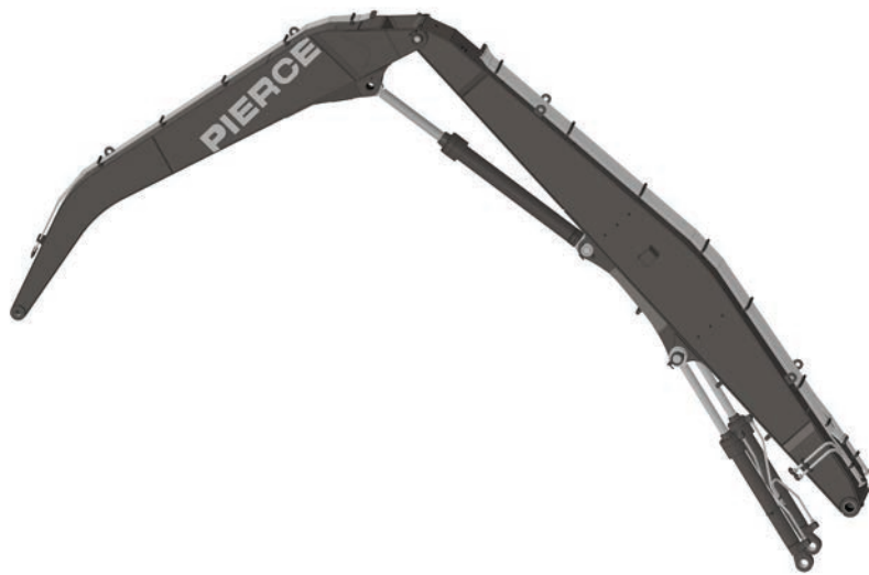
PIERCE PROCESSOR BOOM