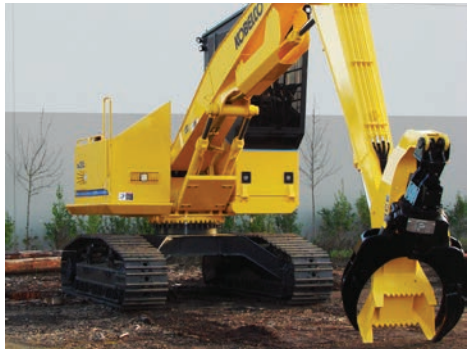
THROUGH-THE-SNOOT LIVE HEEL

Pierce booms are Pierce built, which means you can count on a top-tier machine with full product support and fast delivery on all service parts. Three more great reasons why our forestry booms have set the standard in the woods for decades.