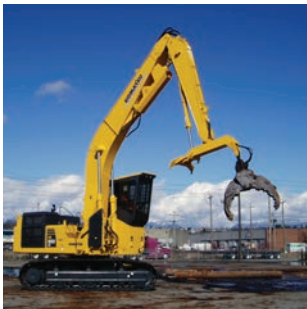
CAMBERED MAIN BOOM