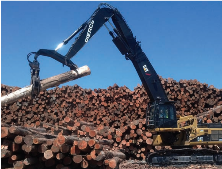
MILLYARD/SORTYARD FORESTRY BOOM