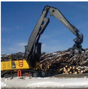
2-PIECE BUTT N TOP