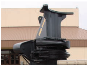
TREE SUPPORT TOWER