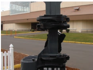
3 HEAVY-DUTY CAST ARMS